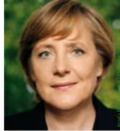
Chancellor Dr. Angela Merkel